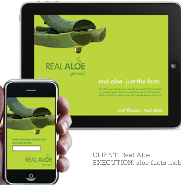
CLIENT: Real Aloe EXECUTION: aloe facts mobile campaign

This means that building an app, mobile experience or Facebook page is simply not enough. We integrate merchandising with digital, social media and print anchored with a big idea to create a brand interface across all lines of communication, because interface determines behavior.