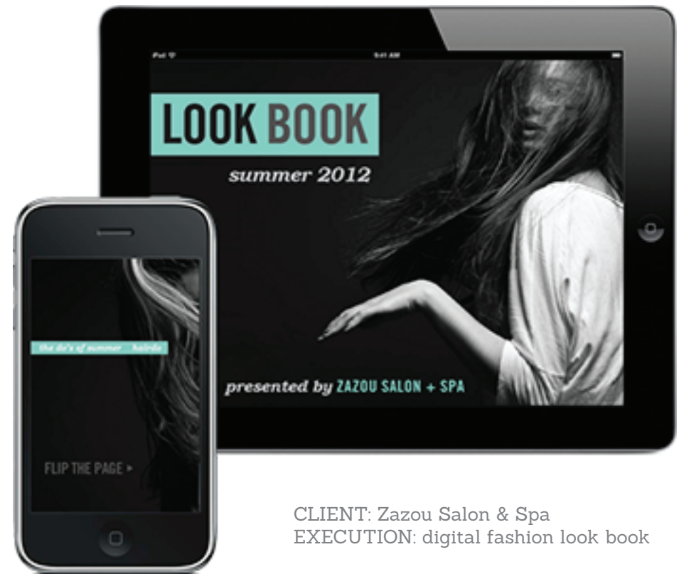
CLIENT: Zazou Salon & Spa EXECUTION: digital fashion look book

We first define differentiation in the marketplace and the brand positioning. We then set clear goals of what the brand needs to accomplish. And, finally we build a plan with with the requisite components. If a client's brand is existing, we ensure that every component we build upholds that brand.